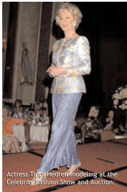
Actress Tippi Hedren modeling at the Celebrity Fashion Show and Auction.

The Screen Smart Set Celebrity Fashion Show and Auction also featured a beautiful display of over 400 fabulous boutique treasures such as jewelry, collectibles, artwork, clothing, purses, scarves and other distinctive accessories...all available for purchase. I bought a few pieces of jewelry that I am